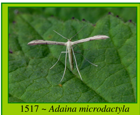
1517 ~ Adaina microdactyla

0336 Phyllonorycter dubitella , leaf mines on goat willow (tenanted) on Breidden Hill (ANG & JEG) 24/09/2016