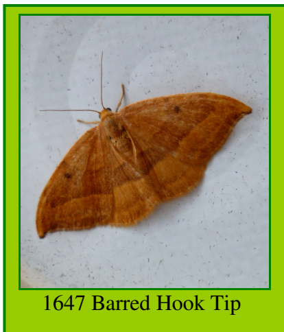
1647 Barred Hook Tip

The Mid July Event was at the Bro Dyfi Community Garden . This was a new venue for us and we had high hopes of a good species list, unfortunately, the weather didn't play ball and it rained throughout the event. However, despite the poor conditions, we did manage to bag 54 species and the 15 people present were treated to three excellent records for the county as a whole – the uncommon Wood Carpet , the scarce Cloaked Minor and a rather nice micro, the Large Tabby Aglossa pinguinalis which had only been recorded on three previous occasions, all on the eastern side of the county.