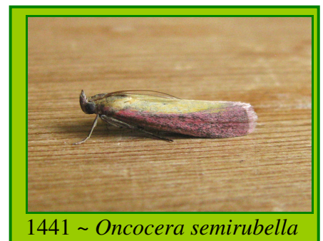
1441 ~ Oncocera semirubella

1441 Oncocera semirubella an individual was caught on a warm night in Middletown (DBo). This 'nationally scarce