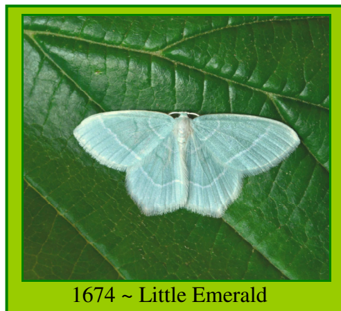
1674 ~ Little Emerald

The Mid June Event was a joint event with Montgomeryshire Wildlife Trust (who was doing bat detecting) at Dolforwyn Woods Nature Reserve . This was Butterfly Conservation's 'Moth Night', the theme of which was Hawk Moths. It was a very mild evening with the temperature not falling below 14c. In all, 54 species were recorded, which included 10 new species for the site; the best of these being the fairly uncommon Little Emerald . The 'Moth Night' theme of Hawk moths yielded three species – Poplar Hawk-moth , Lime Hawk-moth and the Elephant Hawk-moth . The 10 people who attended the event had an excellent evening.