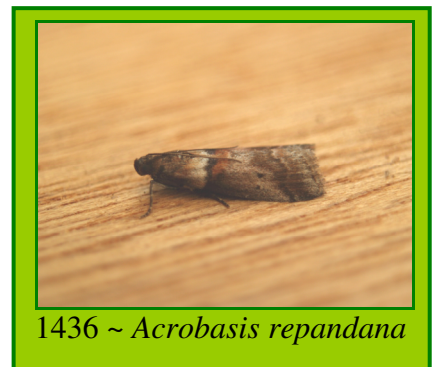
1436 ~ Acrobasis repandana

0038 Ectoedemia subbimaculella , a leaf mine found on oak on Breidden Hill (ANG & JEG) 08/11/2016 0090 Stigmella tiliae leaf mine found on a mature lime tree on Breidden Hill (ANG & JEG) 24/09/2016 0273 Bucculatrix thoracella leaf mine found on a mature lime tree on Breidden Hill (ANG & JEG) 24/09/2016