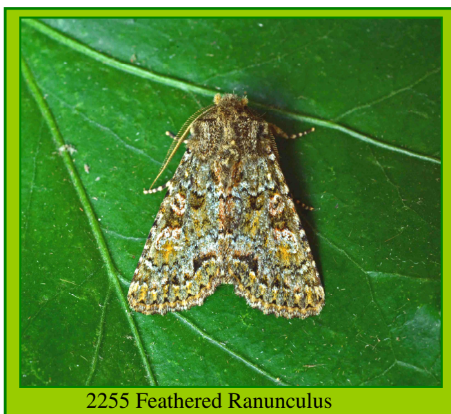
2255 Feathered Ranunculus

Our final event of the year was at Llanymynech Rocks where we were hoping to find some migrant activity. However, it wasn't migrants which took centre stage it was the excellent discovery of a small population of Feathered Ranunculus . Now, whether this is a stable or a transitory population we've yet to find out, but the site will be trapped throughout the 2017 season, so perhaps by the end of the year we'll be able to answer this nagging question.