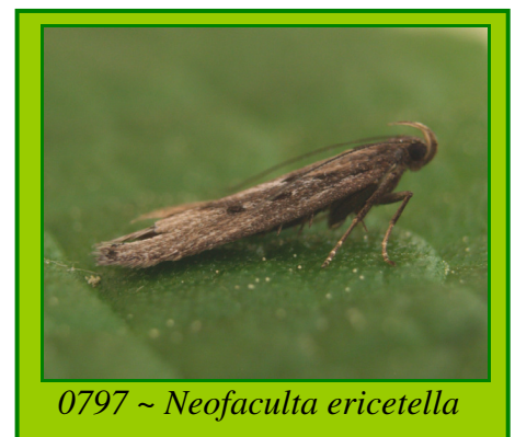
0797 ~ Neofaculta ericetella

Mid March event - Our first event of the year at Coed y Dinas Nature Reserve was fairly run of the mill in coolish