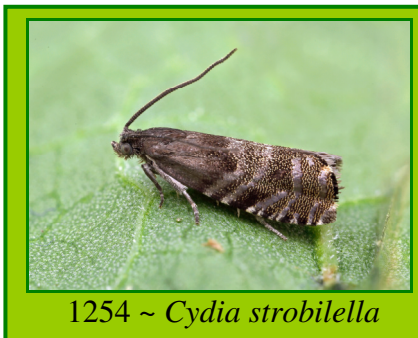
1254 ~ Cydia strobilella

0038 Ectoedemia subbimaculella , a leaf mine found on oak on Breidden Hill (ANG & JEG) 08/11/2016 0090 Stigmella tiliae leaf mine found on a mature lime tree on Breidden Hill (ANG & JEG) 24/09/2016 0273 Bucculatrix thoracella leaf mine found on a mature lime tree on Breidden Hill (ANG & JEG) 24/09/2016