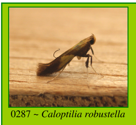
0287 ~ Caloptilia robustella

During the year we held 8 events throughout the county, all of which were well attended.