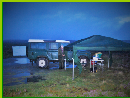
Late August event at Lake Glaslyn A wet and blustery evening

The Early August Event at CAT was also very successful on another mild and dry evening. The 19 people who turned up saw exactly 100 species. The highlight of the event was, definitely, the scarce Barred Carpet , and the 10+ of this species strongly suggests that there is a healthy breeding population at CAT.