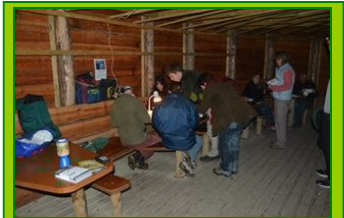
Early October Event at Coed Y Dinas Checking the contents of the traps at base camp

Our last event of the year was in Early October at Coed Y Dinas Nature Reserve . This was the best attended event of the year and the 33 people who turned up on a lovely mild evening witnessed 26 species brought to the table. The best moth of the evening was definitely a Dusky-lemon Sallow, the first time that this species has ever been recorded at a Montgomeryshire mothing event.