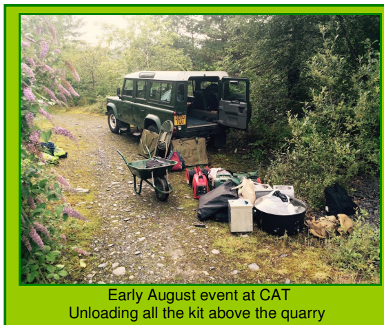
Early August event at CAT Unloading all the kit above the quarry

The Late June Event at Roundton Nature Reserve was very successful indeed. In the mild condition the 20 people who turned were treated to a massive total of 165 species, the highest species count at any event for the year.