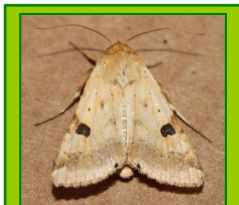
Bordered Straw Heliothis peltigera

2204 Obscure Wainscot Leucania obsoleta – adult to light; Derwenlas (AT); 20-06-15