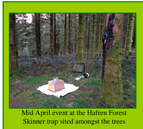
Mid April event at the Hafren Forest Skinner trap sited amongst the trees

Mid April event on this occasion we were at the