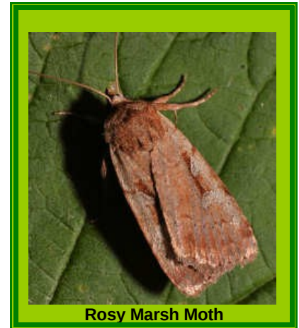
Rosy Marsh Moth

The first good find of the year was the Glaucous Shears, it hadn't been seen in the county since 1977, this year it was recorded from no fewer than five sites, where has it been all these years!