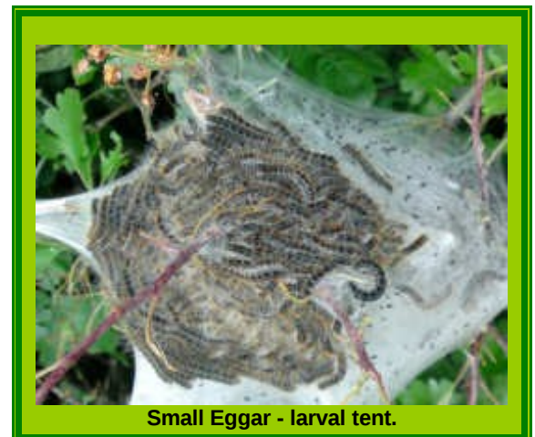
Small Eggar - larval tent.

Next to show up were two separate larval tents of the nationally scarce B species, the Small Eggar (right), a species not seen in the county for over half a century (it had been a target species so it was great to see it rediscovered). In August we were treated to the sighting of a Confused, a nationally local species last seen in Montgomeryshire in 1976. And last but definitely not least, the existence of the Rosy Marsh Moth (right), another target species, was finally confirmed when one was trapped at Cors Dyfi Nature Reserve. We had been looking for this species for many years so what a wonderful moment it was when the moth finally graced us with its presence.