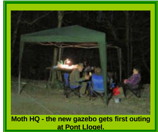
Moth HQ - the new gazebo gets first outing at Pont Llogel.

Once again a full programme of ten events was held throughout the county during 2011 and all events were well attended. The purchase of a gazebo certainly made the mothing a little more comfortable when out in the field, although we nearly lost it at Dolforwyn Woods during some extremely squally weather. The events produced seven of the new county records for the year (which makes running them all the more rewarding). The 2012 event schedule will be published on the events page of the web site, early in 2012.